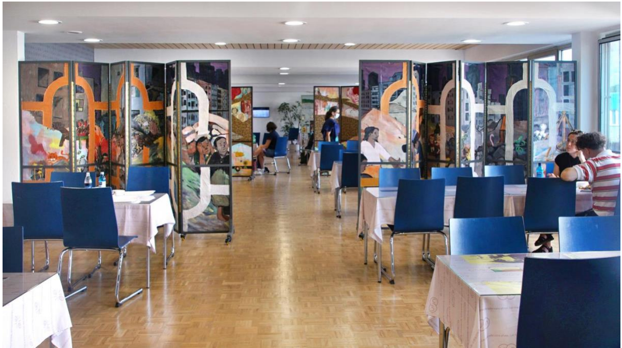
波蘿核於德國第十五屆卡塞爾文獻展 BOLOHO at Documenta fifteen, Kassel, Germany, 2022