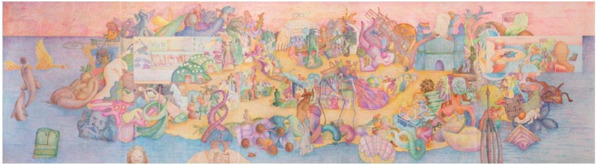
菠蘿核, 《EXIT》, 2022, 集體繪畫, 紙上彩色中性筆, 107.5 × 392.5 公分 BOLOHO, EXIT , 2022, Collective painting from Performance project, color gel pen on paper, 107.5 × 392.5 cm