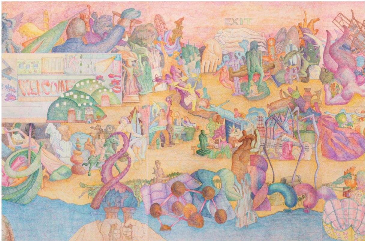
《EXIT》【局部】 EXIT [Detail]