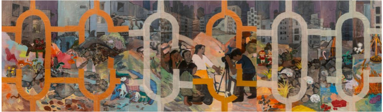
菠蘿核, 《BOLOHOPE 之三》, 2022, 集體繪畫與縫紉, 布面塑膠彩與織物, 200 × 700 公分 BOLOHO, BOLOHOPE No.3 , 2022, Acrylic and textile on canvas, 200 × 700 cm