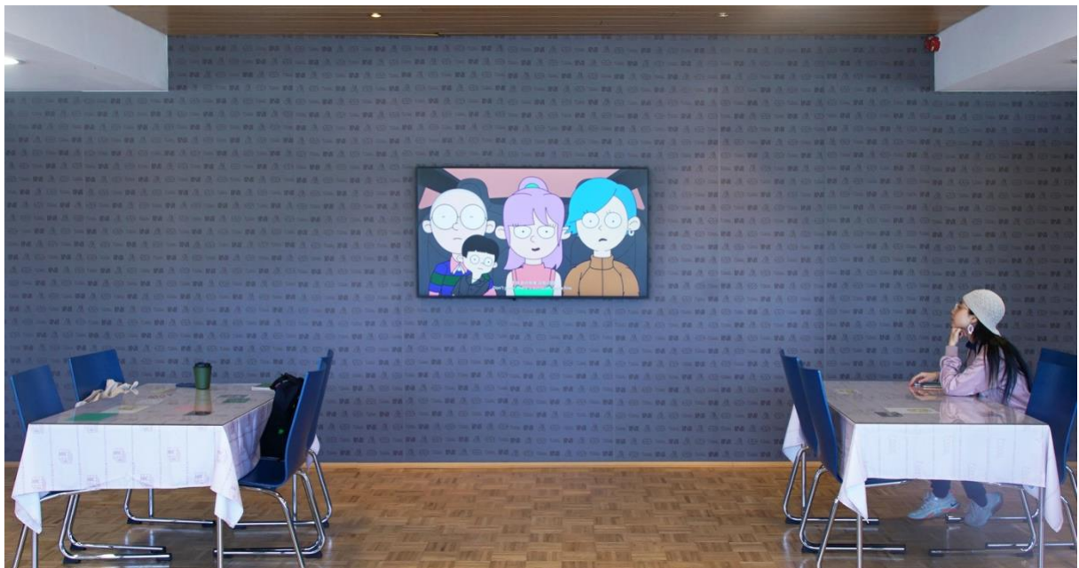
菠蘿核於德國第十五屆卡塞爾文獻展 BOLOHO at Documenta fifteen, Kassel, Germany, 2022