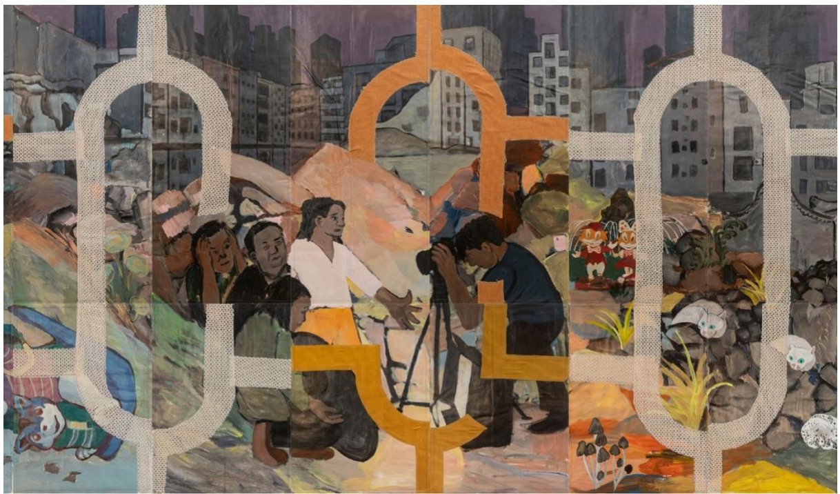
《BOLOHOPE 之三》【局部】 BOLOHOPE No.3 [Detail]