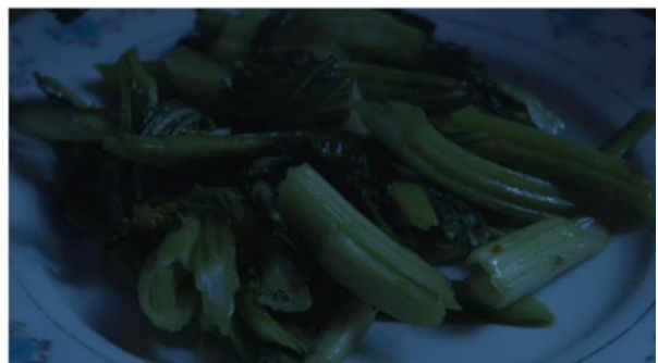
菠蘿核, 《BOLOHOPE - 第一集》, 2022, 4K 影像 (彩色、有聲), 25 分鐘 53 秒 BOLOHO, BOLOHOPE - Episode 01 , 2022, 4K UHD video, color with sound, 25'53"