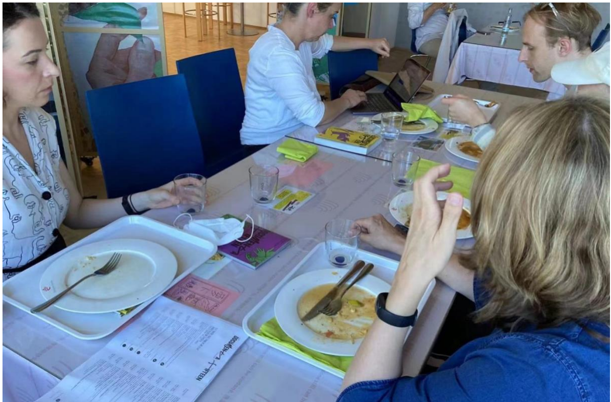
菠蘿核於德國第十五屆卡塞爾文獻展 BOLOHO at Documenta fifteen, Kassel, Germany, 2022