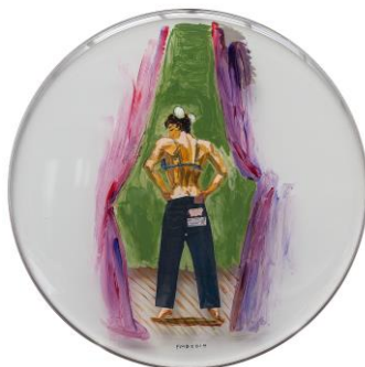
New Pants I 《新褲子之一》 2014 Mixed Media on Polyester and Aluminum (drum skin) 綜合材料 聚酯和鋁 (鼓皮) 57 x 57 cm