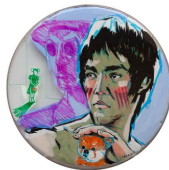
Bruce Lee and My Shiba Inu 《李小龍和我的柴犬》 2014 Mixed Media on Polyester and Aluminum (drum skin) 綜合材料 聚酯和鋁 (鼓皮) 57 x 57 cm

馮夢波一直以政治波普及動電作為創作題材。本展覽首次公開馮夢波過去兩年的最新“後波普”繪畫。這批新穎刺激的作品除了油畫與水墨，還大量使用鼓皮、立體光柵照片等綜合材料，打破波普與通俗媒介的界線。這些“後波普”繪畫五顏六色、詼諧幽默、充滿「惡」趣味。馮夢波從通俗媒介中提取豐富的語彙，政治宣傳海報、流行電影、卡通動漫及電玩遊戲都被他利用起來。然而今天，傳統藝術元素像徐悲鴻的馬、齊白石的蝦及李苦禪的鷹也不知不覺地被挪移到通俗媒介的境地之中。這些現象都是馮夢波的創作靈感。