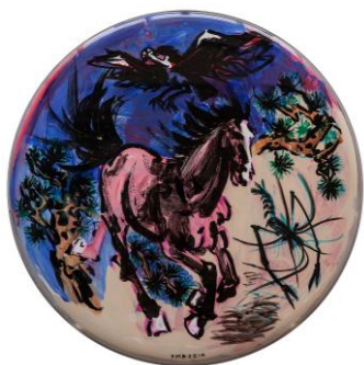
Crazy Horse 《瘋馬》 2014 Mixed Media on Polyester and Aluminum (drum skin) 綜合材料 聚酯和鋁 (鼓皮) 57 x 57 cm

馮夢波個展《大音無響：馮夢波圖譜》訂於 2015 年 5 月 8 日（週五）晚上 6 時在畢打行漢雅軒開幕。 馮夢波開幕當晚在畫廊演奏原創電子音樂會慶祝。