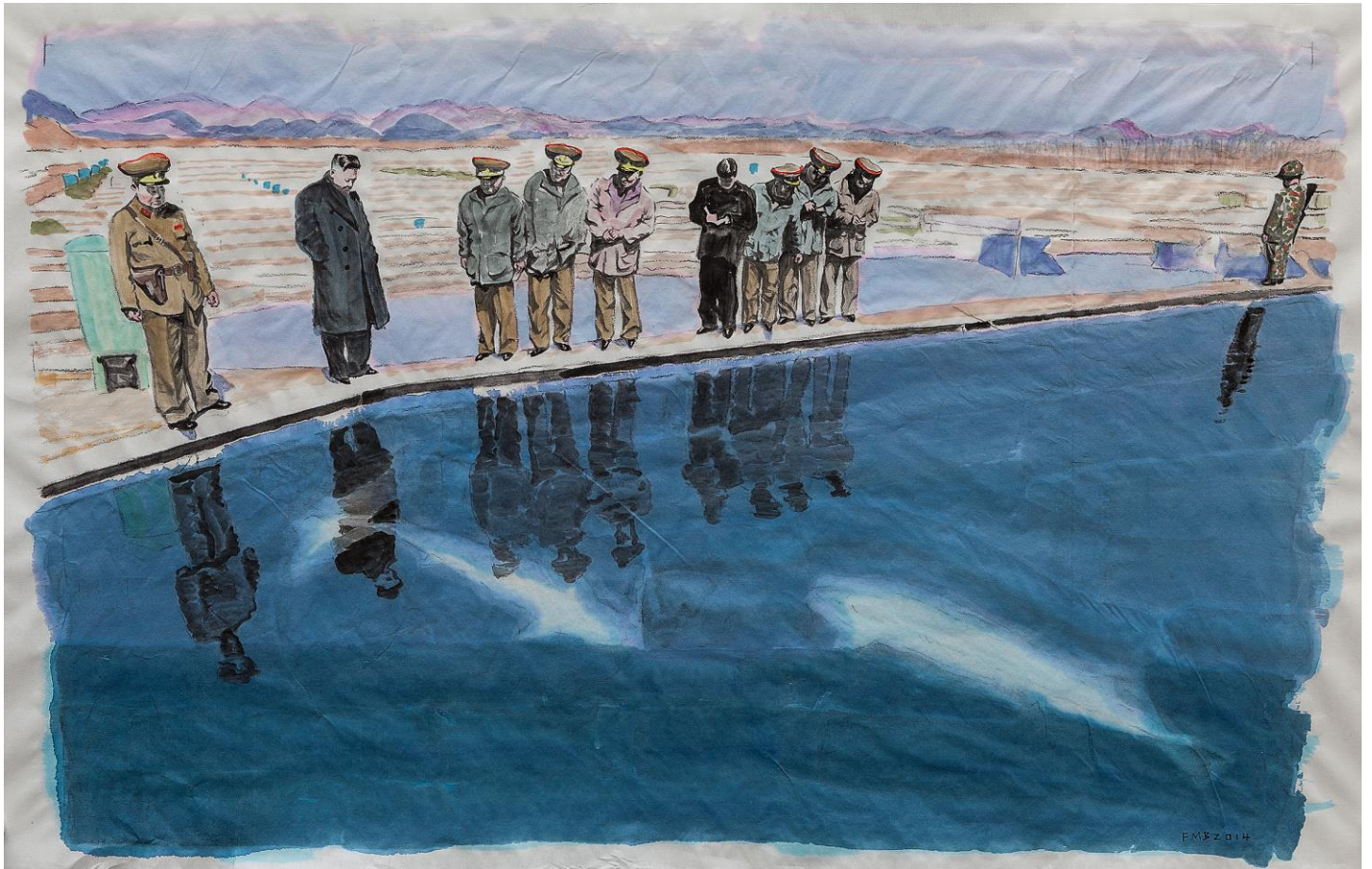
Two Great White Sharks 《兩條大白鯊》 2014 Watercolour on Chinese Paper 水彩 宣紙 68 x 136 cm

An enthusiastic musician in the techno and electronica styles as well as an artist, Feng Mengbo will perform in a live mini-concert at the opening reception on 8 May.