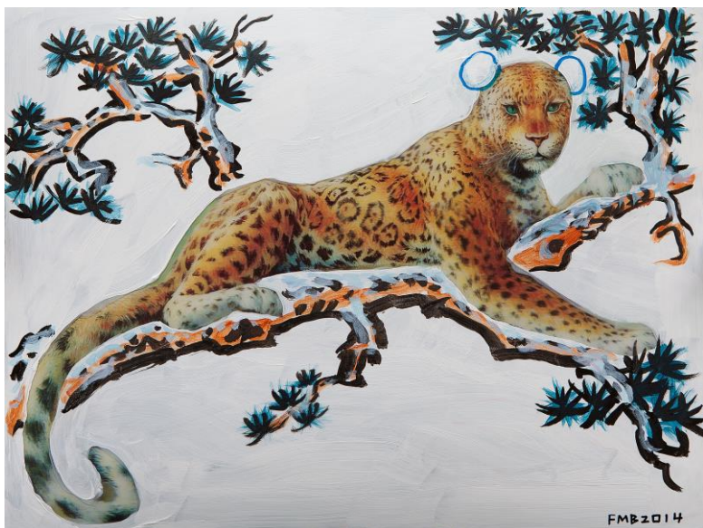
Green Pines 《蒼松》 2014 Mixed Media on 3D Lenticular Print 綜合材料 光柵片 30 x 40 cm

馮夢波把想像的及借用的圖像重組並置，極具意味。大眾熟悉的人物，如電玩角色《街頭霸王》中的春麗，以及功夫明星李小龍居然與徐悲鴻的壯馬同時出現在庸俗的光柵立體風景照上。馮夢波以這些玩世不恭的戲謔畫面，重新審視他年輕時那個對視覺充滿幻想的年代。巾幗英雄春麗標誌著他的成長及青春年代的回憶。這些回憶既是社會的也是個人的，籠罩著對文革的朦朧印象。