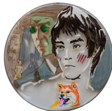
Kneel Down 《給跪了》 2014 Mixed Media on Polyester and Aluminum (drum skin) 綜合材料 聚酯和鋁 (鼓皮) 57 x 57 cm