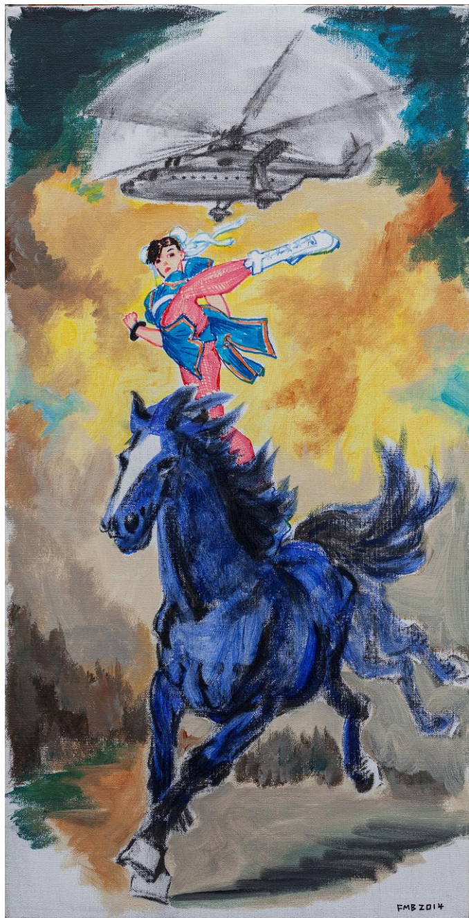
The Indigo Horse 《藍馬》 2014 Mixed Media on Canvas 綜合材料 畫布 80 x 40 cm

Hanart TZ Gallery proudly presents a solo exhibition of new works by Feng Mengbo, revealing an exciting new dimension to this celebrated multi-media artist.