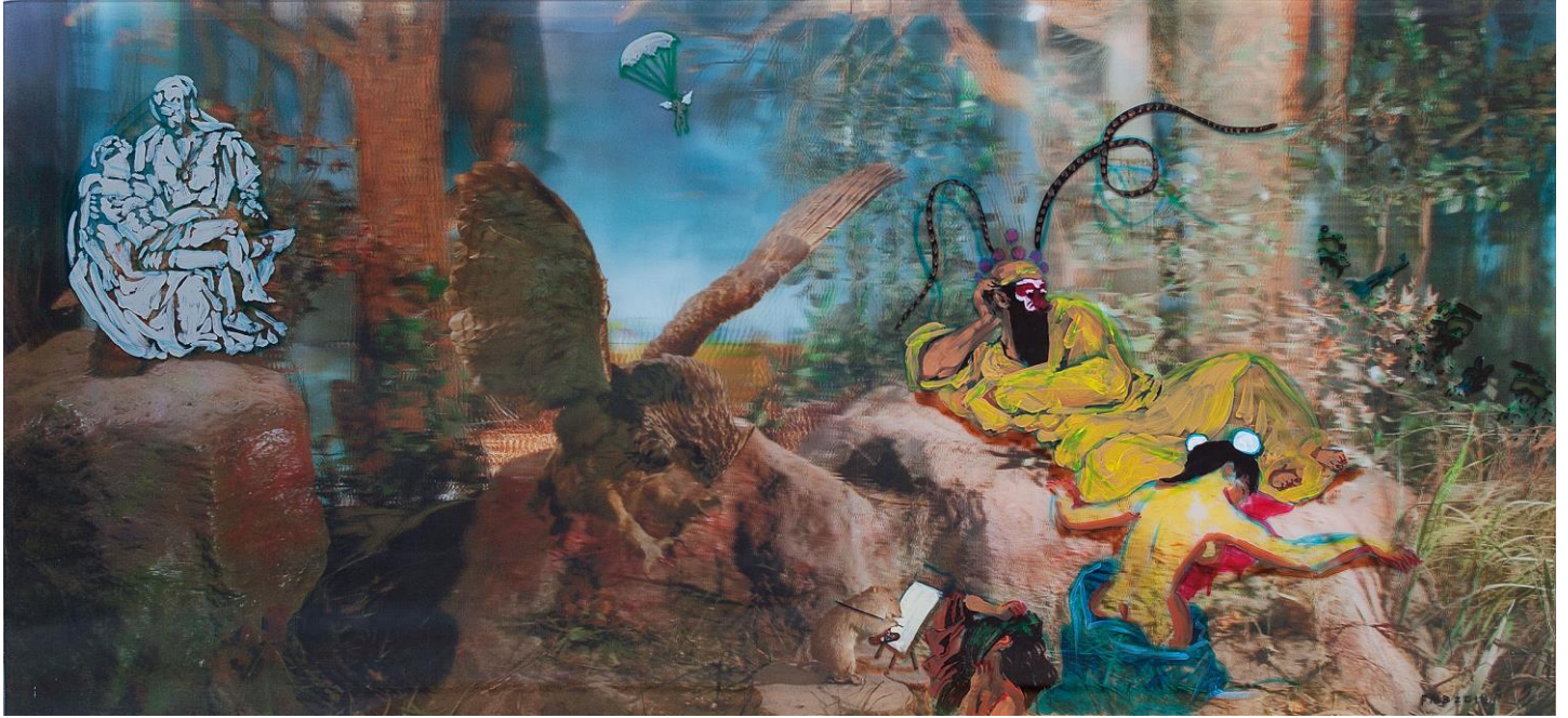
Farewell to My Concubine 《霸王別姬》 2014 Mixed Media on 3D Lenticular Print 綜合材料 光柵片 46 x 104 cm