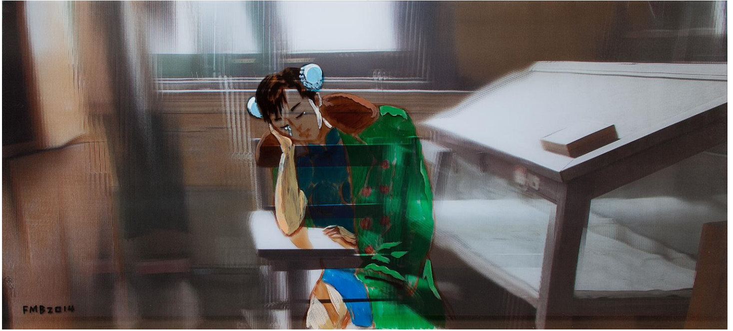
Night Shift 《夜班》 2014 Mixed Media on 3D Lenticular Print 綜合材料 光柵片 31 x 68 cm

本展覽將會以「沙龍」形式展示超過 70 幅全新繪畫。畫廊更會同時變身為一個電玩遊戲廳（機鋪），展出四臺馮夢波的互動電玩裝置（街機），讓觀眾可以挑戰由他編寫的電玩遊戲《長征：重啓》。目前紐約現代美術館（MoMA, New York）正在舉辦 Scenes from a New Heritage 群展，包括馮夢波《長征：重啓》電子遊戲的巨型隧道裝置版本。